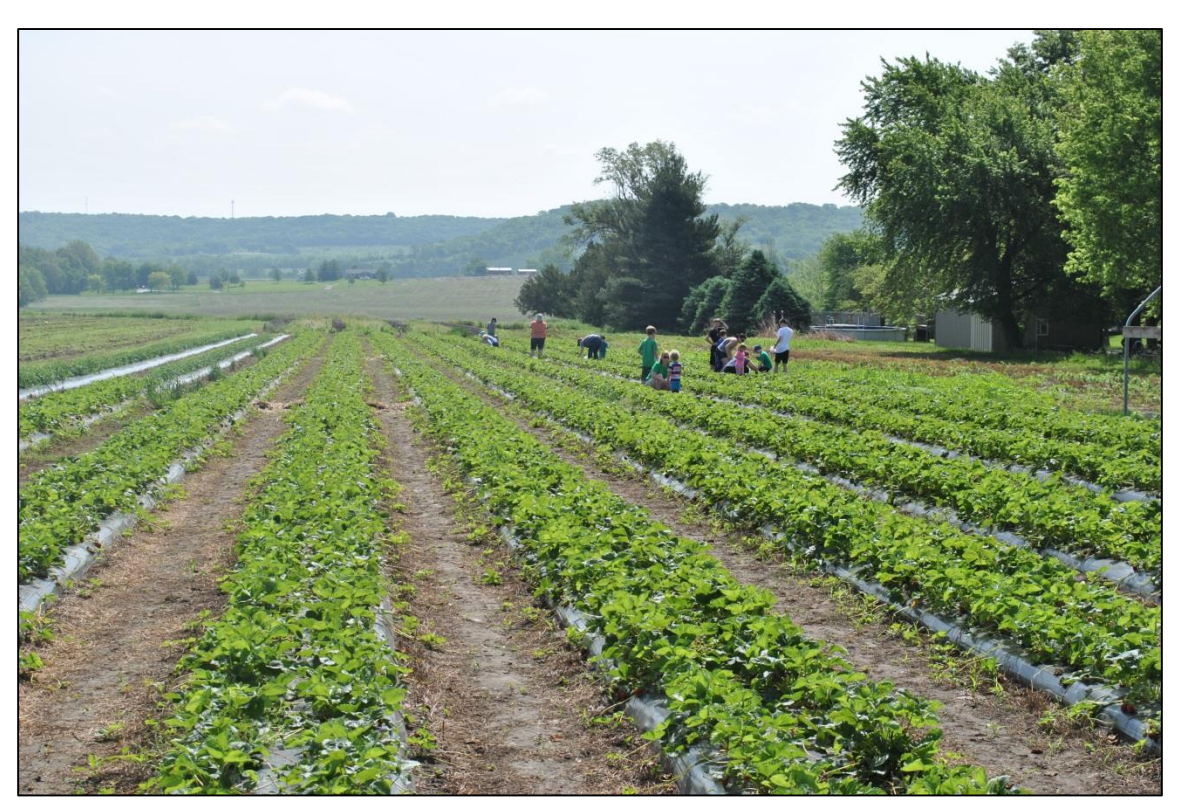
In 2014, Schwinn Produce Farm & The Barn received REDLG financing to expand their u-pick operation.