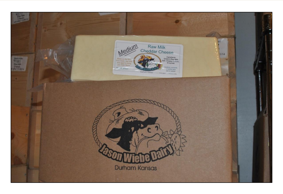
In 2014, Wiebe Dairy received VAPG funding to further expand their Internationally awarded cheese into additional national markets.