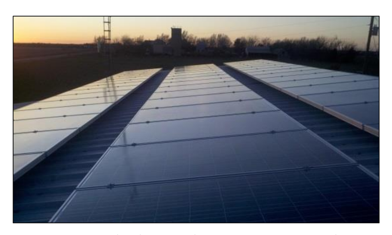
In 2012, ARC Technology in Whitewater, Kan., received a REAP grant to install a 12.2 kilowatt solar array.