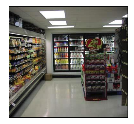
REAP funding to upgrade refrigeration units to more energy efficient units